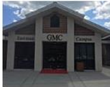
GMC Eastman Extension Center