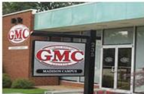
GMC Madison Extension Center