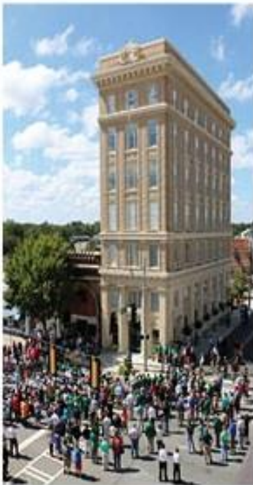
GMC Dublin Extension Center

The Zebulon extension center is the newest of the four GMC campuses in the Atlanta Metropolitan Region and provides courses for GMC students in Pike County and surrounding areas. The center is located in the Zebulon City Hall facility adjacent to Zebulon City Park at 7818 Highway 19 South. Open for postsecondary classes in March 2018, this campus offers GMC students the opportunity to complete classes toward an Associate or Bachelor of Applied Science Degree. Zebulon students, faculty, and staff have full access to library resources from the main campus and are supported by the Fayetteville Campus Library Associate.