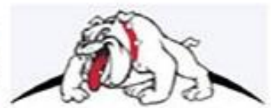
GMC Albany Extension Center