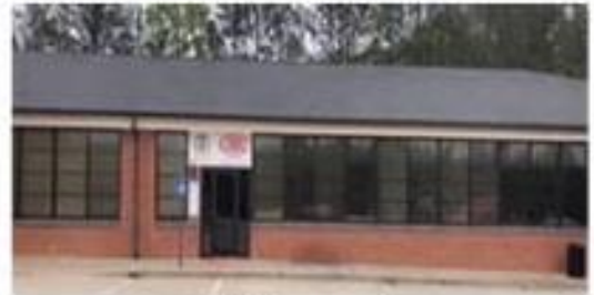
GMC Zebulon Extension Center