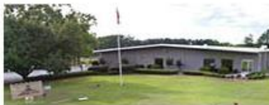
GMC Sandersville Extension Center