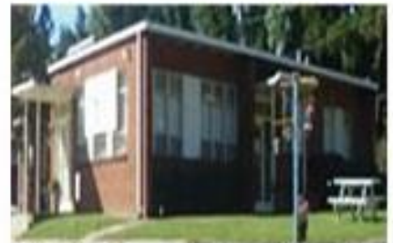
GMC Stone Mountain Extension Center